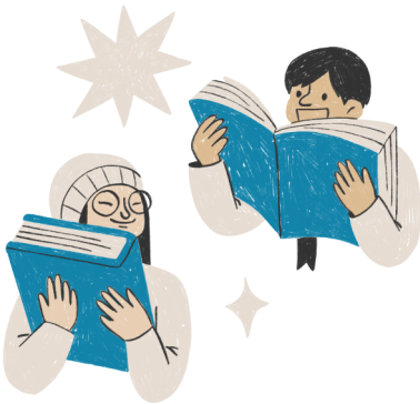
Dog Parade, Poetry Month, Book Sale 2024

We have a Public Notary at the library! Call 231-386-9131