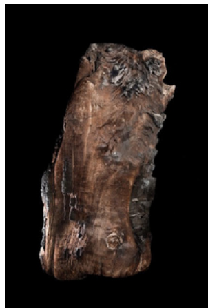
Relic #3 (from Omena Road Orchard Burn), 2024